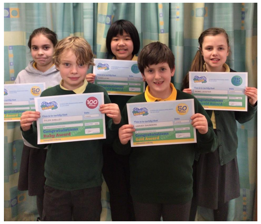
Children from Class 4 with their certificates